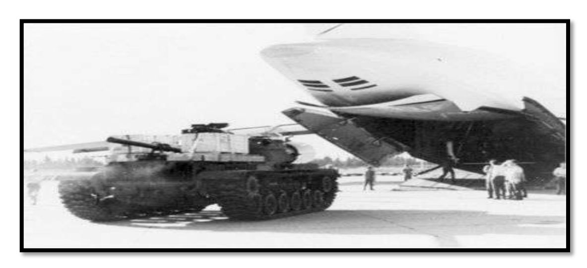
Figure 2.3 M60 tank unloaded from a USAF C-5 Galaxy during Operation Nickel Grass

Even when inflation is considered, U.S. yearly contribution to the Middle East in decades after WWII was a minuscule fraction of current aid disbursements to the area, under dramatic different geopolitical conditions, US strategy was focused on assisting oil-producing nations in their growth, maintaining a neutral stance in the Arab-Israeli conflict while protecting Israel's security and limiting Soviet influence in Iran and Turkey (Ehnsio. R, 2001). In 1950s and 1960s, US officials employed foreign aid to achieve these goals (Sharp. J.M, 2010).