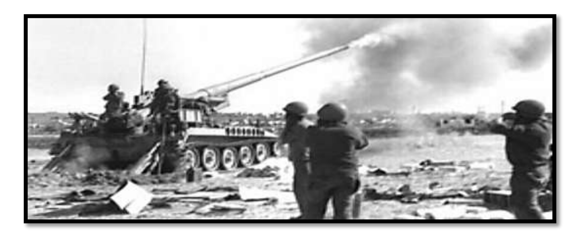
Figure 1.1 Israel Defense Forces troops firing at Syrian targets on the northern front during the 1973 Yom Kippur War.